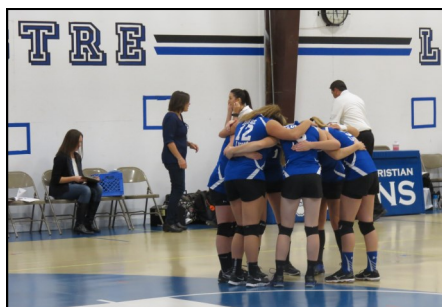
Pre-game team prayer

All Glory to God for a job well done by the Lady Lions representing our Lord well both on and off the court. GO LIONS!!