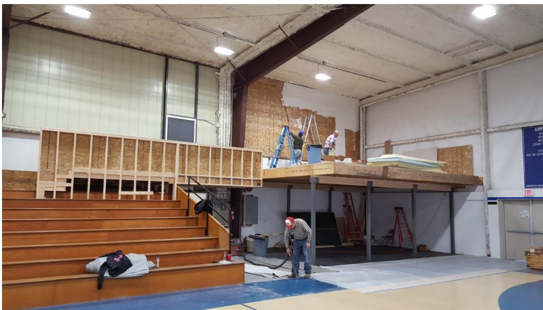
Work being done to build the mezzanine which will give convenient access to the assembly room.

On behalf of the board, we would like to thank you for your support in this project! As we look forward to the future, we would ask that you prayerfully consider giving towards further building improvement needs. The next goal of the board is to replace siding and windows on the rest of the school.