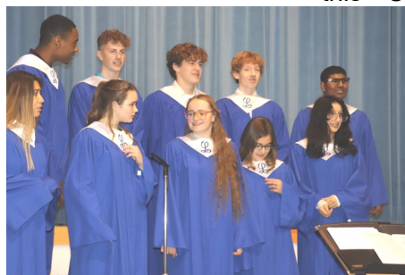
The LCHS Choir preparing for their first number of the evening.

enjoyed it, and the Lustre High School wishes you a good Christmas Holiday and a Happy New Year!