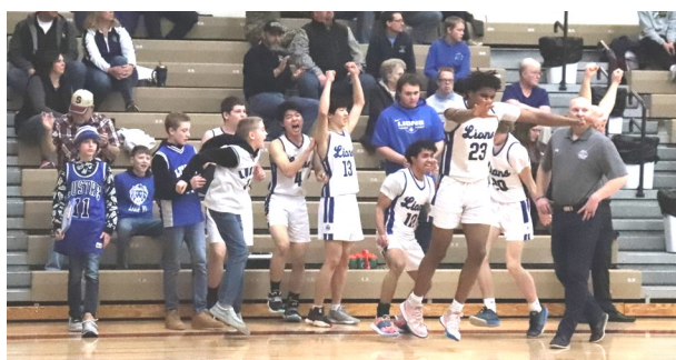
Celebrating victory over the Spartans at the Eastern C Divisional Tournament in Sidney.