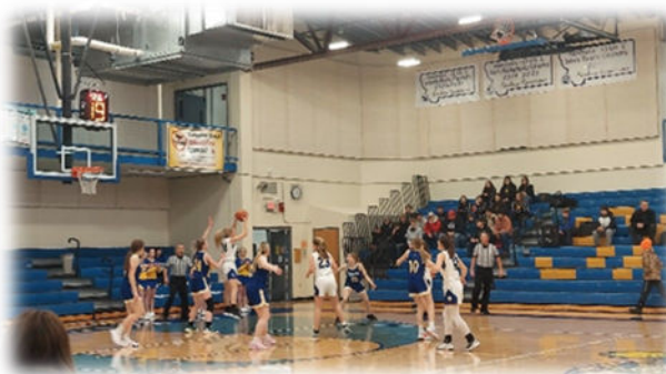
Lady Lions playing against Fairview Warriors on loud!

challenge the next day. The game started out slow but got the ball rolling as the game went on. The Lady Lions kept trying to score and didn't give up to the end. The boys came out with great energy, and the game was intense the whole time. The offensive and defensive effort throughout the game ended up with a big win score of 52-24. We are now on track for an exciting regular season. Make sure to come watch the Lions and cheer them